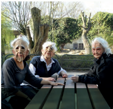
Art Collective NEOZOOM

artist's statement NEOZOOM's work focuses on the relationship between animals and humans, and how modern societies deal with both – dead and living animals. Neozoom actions take place in public spaces: city streets, public institutions and the web. Their artistic mediums range from collage to installations and film. Recycling found footage is also a recurring element in their work, where the group often employs amateur videos from YouTube. Amongst others their work has been shown at the Centre Pompidou in Paris, the HKW in Berlin, the Internationale Kurzfilmtage in Oberhausen, the ZKM in Karlsruhe and at the IFFR in Rotterdam.